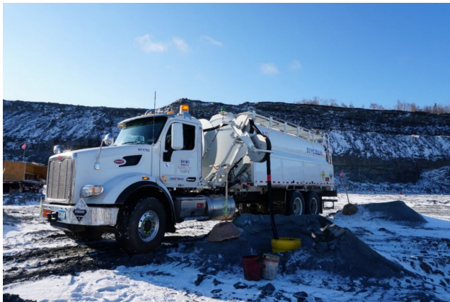
Figure 2. A TITAN jumbo mobile production unit with ΔE 2 capability when loading a blasthole.